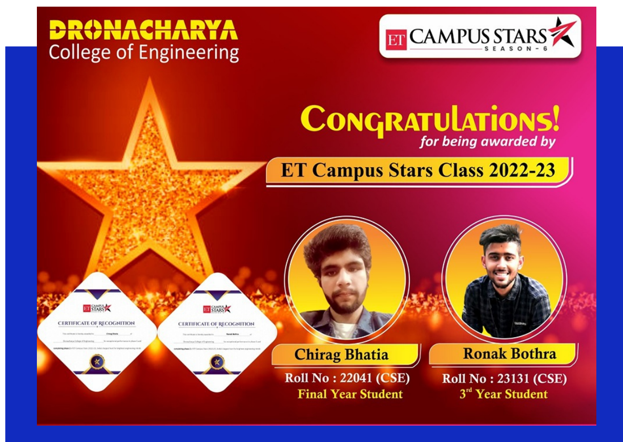
ET Campus Star Class 2022-23