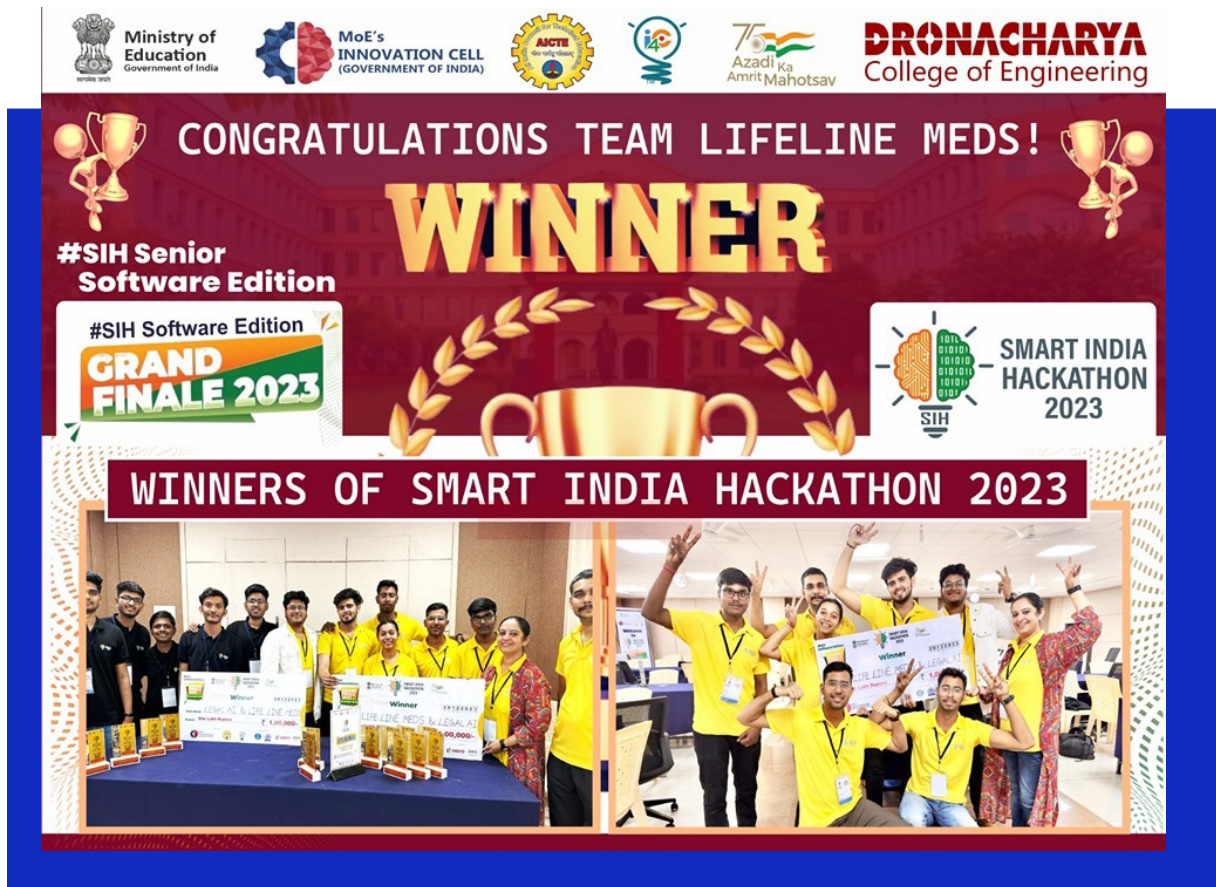
Winners of SIH-2023 (Software Edition) Team LifeLine Meds