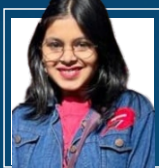
SONAL Roll No : 22158