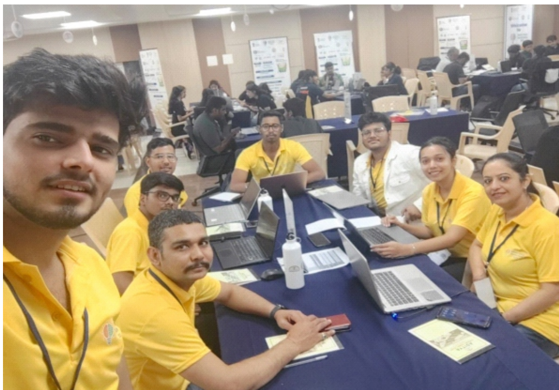
Team Life Line Meds

Website: https://ggnindia.dronacharya.info/